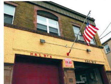
O quartel Engine 5, no Ironbound, que recebeu a bandeira